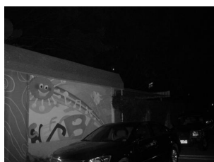
With IR light